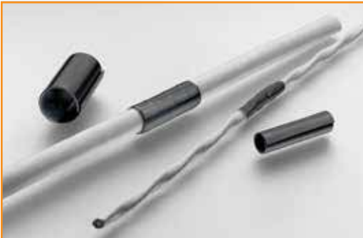
Rayseal Large-Gauge, Side-Entry Cable Repair Sleeve

Large-Gauge, Side-Entry Cable Repair Sleeve